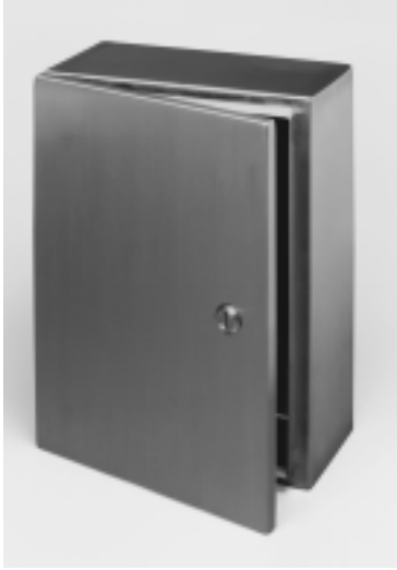
Single Door with Quarter Turn